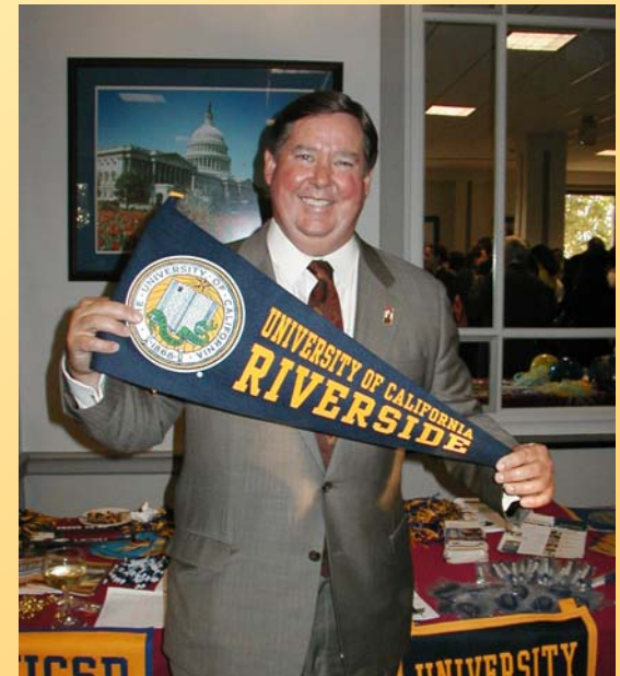
Congressman Ken Calvert